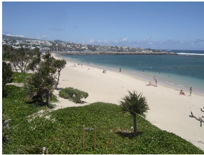
The beach at saint-pierre